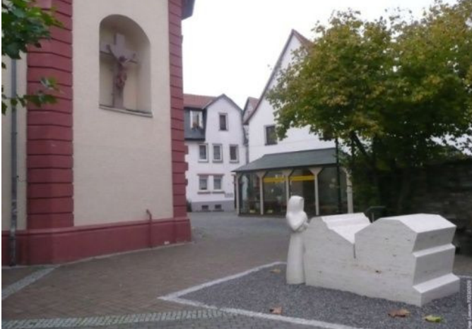
December, 2007: The first part of the memorial, the middle piece and one figure

A ceremony took place in Hospital Church on December 10, 2007 to inaugurate the first part of the memorial, the middle piece and the first figure.