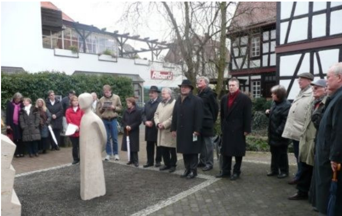
Placement of the second figure, donated by the Oberursel building association

A second figure could be installed in March 2009, due to a large donation.